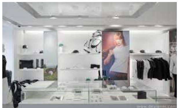
Precise illumination for retail applications