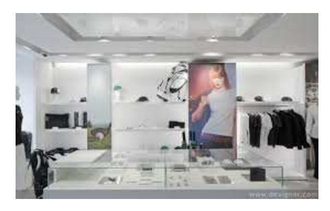
Precise illumination for retail applications

The TPSL Series LED Shoplight is the perfect solution for retail and commercial wall washing applications. It combines the latest LED technology in a classic adjustable design. Perfect for retrofitting inefficient Metal Halide fittings and new installations where energy efficiency is a crucial factor.